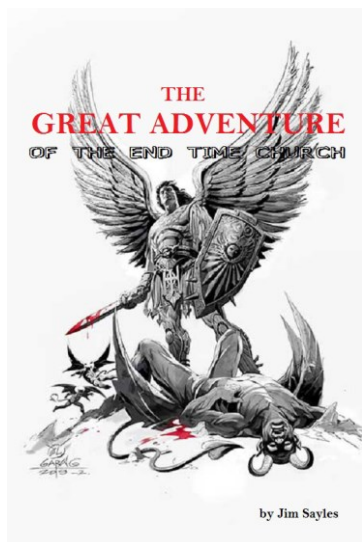
THE GREAT ADVENTURE of the End Time Church

Books by the author available on Amazon, Barnes & Noble, and retail bookstores whether in stock or ordered through Ingram. Both print and eBook formats available. Complete descriptions of each book are on the website.