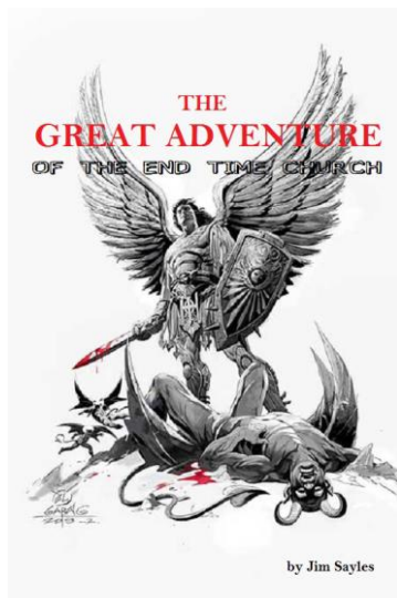
THE GREAT ADVENTURE of the End Time Church

Books by the author available on Amazon, Barnes & Noble, and retail bookstores whether in stock or ordered through Ingram. Both print and eBook formats available. Complete descriptions of each book are on the website.