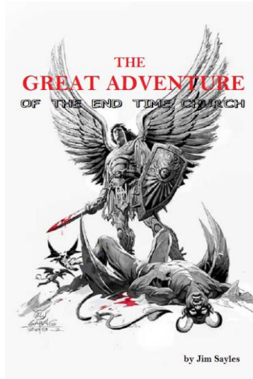
THE GREAT ADVENTURE of the End Time Church

Books by the author available on Amazon, both in print and eBook formats. Complete descriptions of each book are on the website.